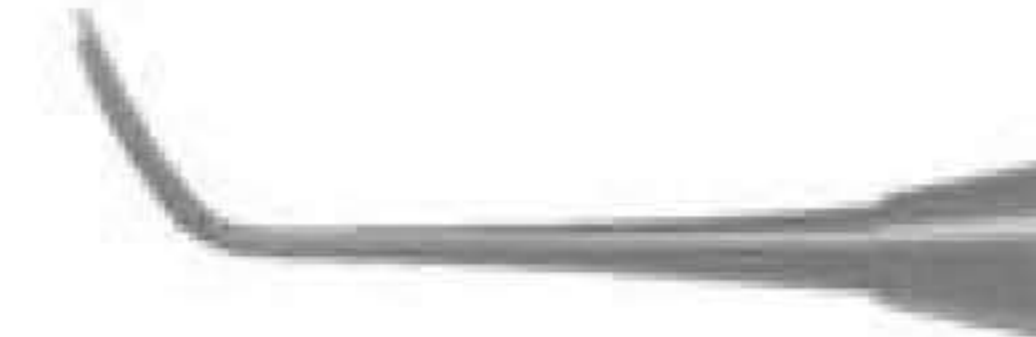
1900 GOLLOBIN Fig. 1