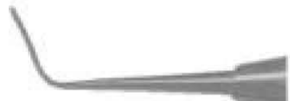
1905 Interproximal 1