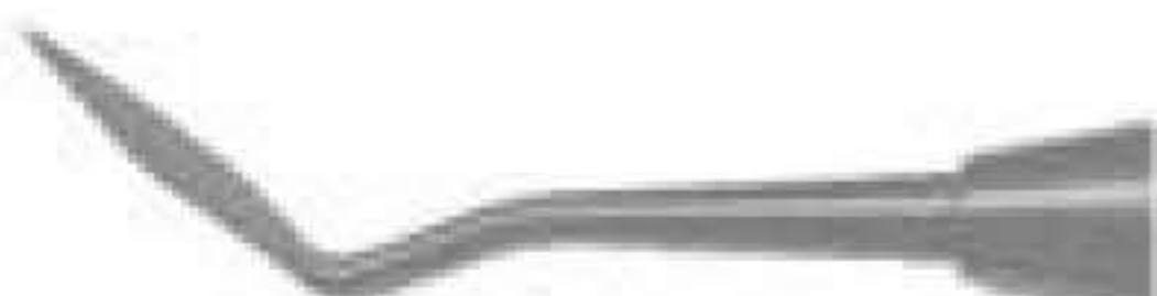
1911 Sho A Carver