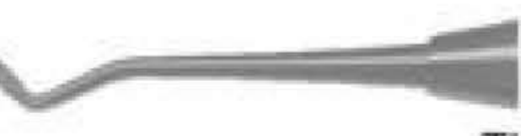
1910 THOMPSON (Fig. 8) (3mm Cleoid & Wall 3)