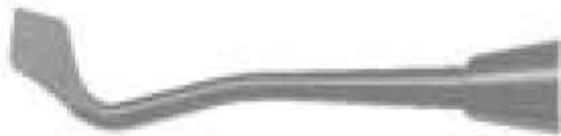
1903 FRAHM Fig. 2-3 (off-angle)