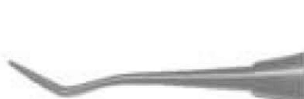
1906 THOMPSON (Fig. 3) (1/2 Hollenback Hoe & Wall 3)