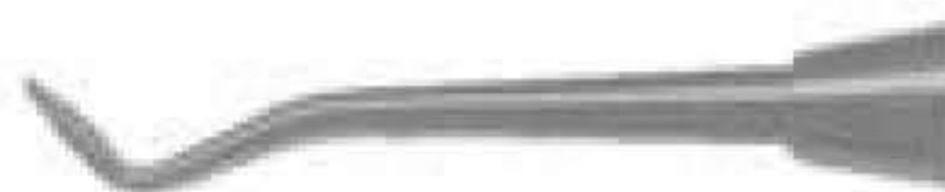
1901 3mm Cleoid Discoid