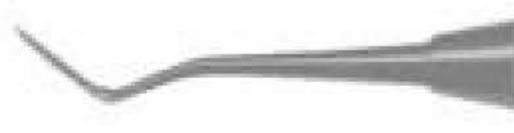
1913 Thompson 2