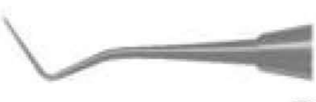
1908 THOMPSON (Fig. 5) (1/2 Hollenback Hoe & Tanner 5)