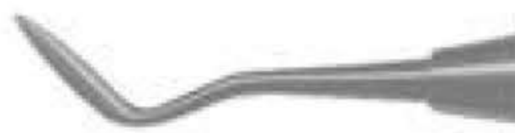
1904 HOLLENBACK Fig. 3