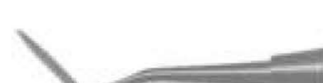
1912 THOMPSON (Fig. 9) (Hollenback 3 & Wall 3)