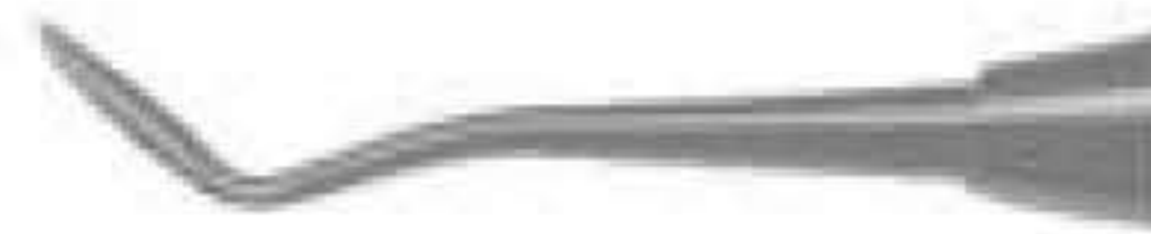
1902 HOLLENBACK Fig. 1/2