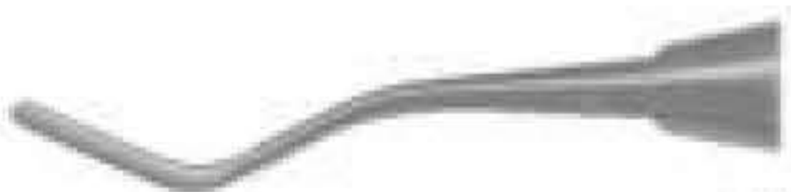
1909 Baum Interproximal