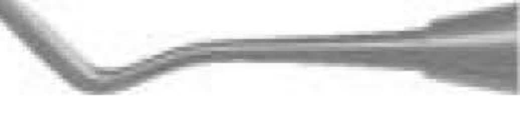
1914 WARD Fig. 2